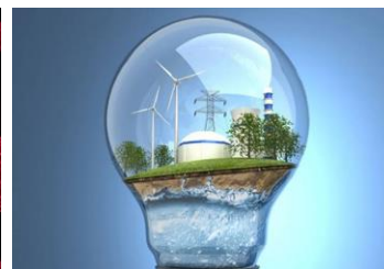
PROVIDING SUSTAINABLE ENERGY