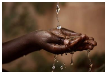
PROVIDING CLEAN WATER