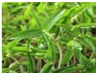
TRANSFORMING AGRICULTURE AND FOOD SECURITY

Harnessing Nanotechnology for Sustainable Development in Energy, Water, Health and Agriculture